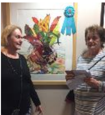
Honorable Mention "Crystal and Crotons" by Lynn Holland