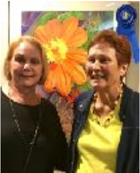
1st Place "Yellow Button" by Mireille Doyon